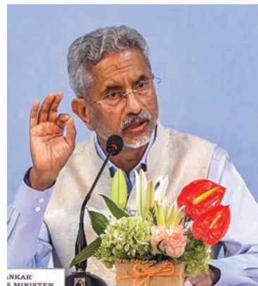
the business council meeting include Murat Nurtleu, Deputy Prime Min-

ister and Minister of Foreign Affairs of Kazakhstan; Zheenbek Kulubaev, Minister of Foreign Affairs of Kyrgyzstan; Sirojiddin Muhriddin, Minister of Foreign Affairs of Tajikistan; Rashid Meredov, Deputy Chairman of the Cabinet of Ministers, Minister of Foreign Affairs of Turkmenistan; and Saidov Bakhtiyor Odilovich, Minister of Foreign Affairs of Uzbekistan, a FICCI statement said. The 4th India-Central Asia Dialogue will be held on Friday in the morning, at the same hotel.