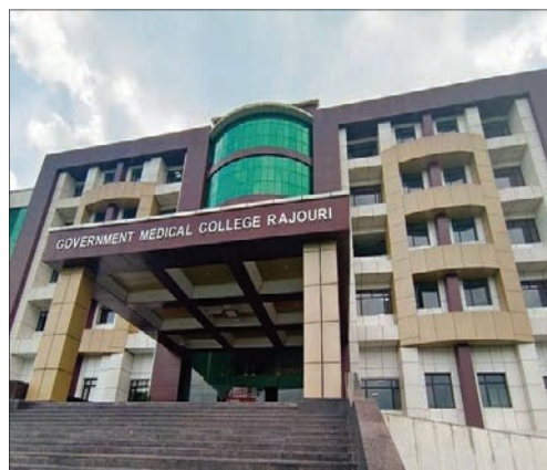
According to the order, the following departments are to be shifted to the old hospital building at

In a formal order issued by Principal Dr. A S Bhatia a copy of which lies with news agency JKNS reads, it has been conveyed that the relocation plan aligns with NMC norms, focusing on infrastructure optimization and associated bed strength expansion. A committee constituted earlier recommended the shift after evaluating the feasibility of the relocation.