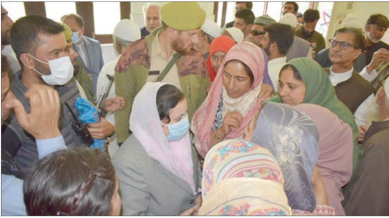
ing of the Primary Health Centre (PHC). She directed the executing

At PHC Kakapora, the Minister also reviewed the progress on ongoing works at under-construction build-