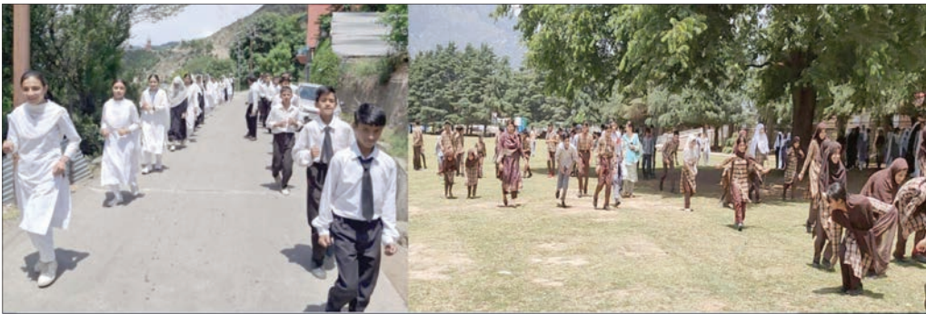
and 250 girls, drawn from Middle Schools, High Schools and Higher Secondary Schools of the twin zones. The students actively joined hands to clean their surroundings while running symbolizing a strong commitment to environmental