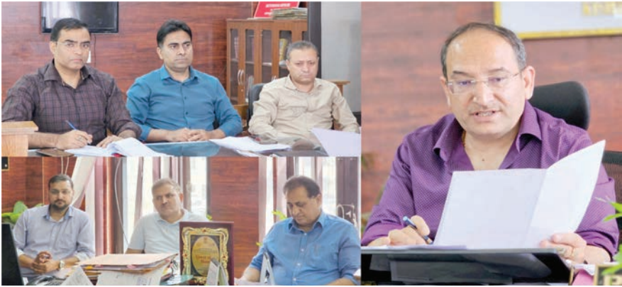
to expedite the implementation process. He directed concerned officers to activate YUVA Doots and set clear targets for them to ensure timely results. Yuva Doots are