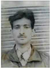
BY MOOL RAJ

I am writing to express a growing concern that I believe requires immediate attention: the extreme and unprecedented rise in temperatures currently being experienced in Jammu and Kashmir. This summer has seen temperatures soar to levels that are not only uncomfortable but also pose significant health risks to the population. Moreover, forecasts indicate even higher temperatures in the coming week, exacerbating an already critical situation.