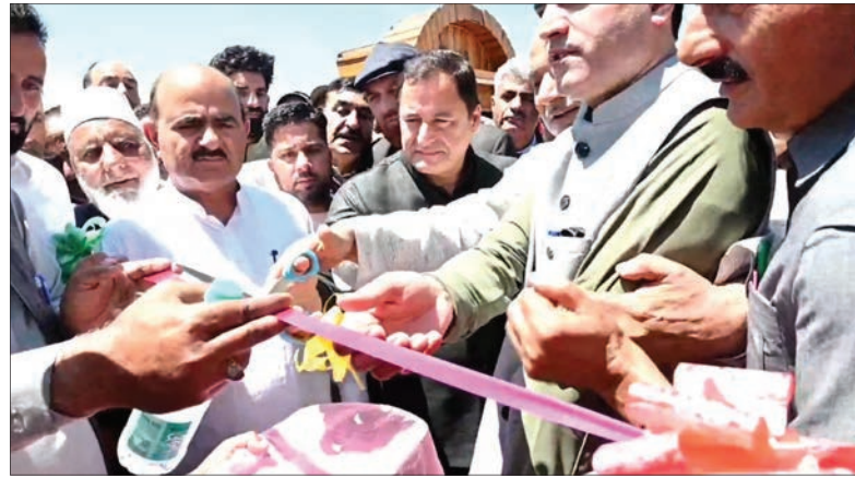
Mela will be organized soon at Sopore Mandi to promote awareness, show-

While speaking to the media, the Minister said that the government is committed towards creating a comprehensive and grower friendly environment in the Mandi. "Along with road improvement, we are also working to enhance the facilities for the labourers, including construction of a Labour Sarai and other essential amenities to support their welfare, he added". He announced that a Mega Kisan