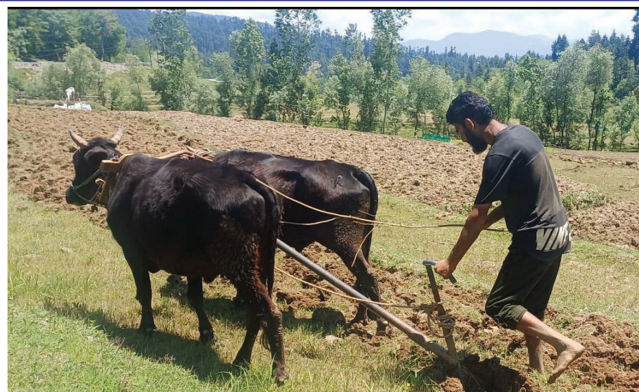
Post Ceasefire Farmer is busy ploughing in frontier district of Kupwara

Rajnath Singh's visit to J&K today postponed