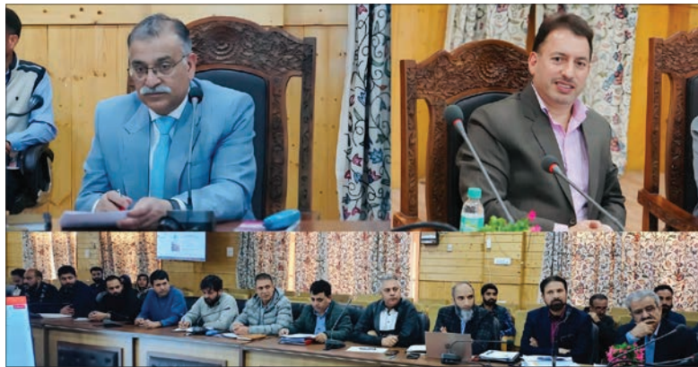
MD JJM urged the officers to expedite the work on pending JJM schemes and ensure the timely completion of all ongoing projects.

faced. It was informed that 121 schemes, with 240 works, are currently underway across the three sub-divisions of Bandipora, out of which 60 schemes comprising 160 works have been successfully completed. The meeting focused on a detailed review of the progress of civil works, mechanical works, and the status of electric substations under the JJM projects. The officers also discussed the ongoing efforts towards achieving the 'Har Ghar Jal' target and reviewed the progress of Functional Household Tap Connections (FHTC).