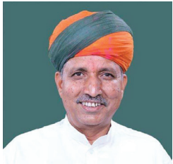
ARJUN RAM MEGHWAL

It is high time that the Hajj Committee of India takes up the issue with the Saudi government at the earliest so that the confusion comes to an end. All the mainstream politicians of Jammu & Kashmir have already voiced their concern on the issue and have demanded that necessary and corrective action is taken. They said that this would absolve the thousands of intending pilgrims of the tension and they would be able to undertake the holy pilgrimage.