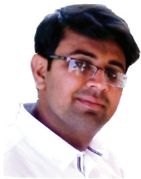
DR. SATYAWAN SAURABH

The writer is Union Minister of State (I/C) for Law and Justice, Minister of State for Culture and Parliamentary Affairs, and Lok Sabha MP from Bikaner.