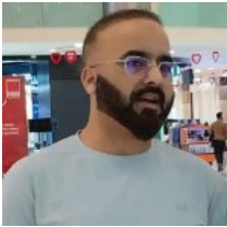
SYED HIDAYAT BUKHARI THE SOCIETAL LENS

There are legislators within the National Conference who believe that the party is not doing enough to get the statehood restored to Jammu & Kashmir. The common masses are also keeping their fingers crossed on the issue and they too are waiting for the day when Jammu & Kashmir becomes a state once again. There are people who believe that the problems being faced by them can be resolved if only statehood is restored.