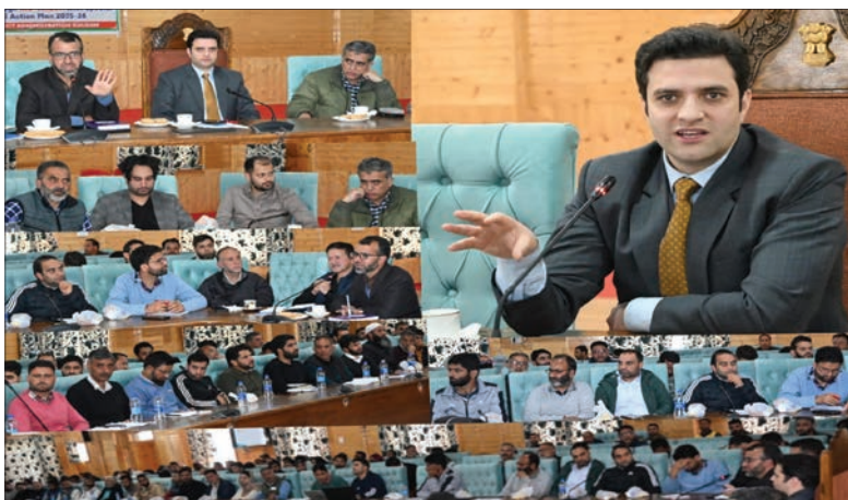
workshop included: Best Practices in Sustainable Asset Creation under

Speaking on the occasion the DDC emphasized the transformative potential of MGNREGA in promoting not just rural employment, but also environmental sustainability, social equity, and grassroots development. "I have seen deserts gets converted into green land under MGNREGA in "natural resource management" programme. "It is right opportunity to make people to earn their livelihood under this scheme." he added. "This scheme is meant for the poorest of the poor, for their welfare if implemented properly on ground" he maintained. The key issues discussed during the