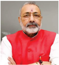
GIRIRAJ SINGH UNION MINISTER FOR TEXTILES

It is imperative that the union territory government chips in and pulls up the concerned officers as well as officials so that the people heave a sigh of relief. A deadline needs to be set in this regard and it must be ensured that the necessary works are completed within the stipulated time frame. This would ensure that the KPDCL and SMC officials would take pain in settling this issue and the same would be hailed by the common masses.