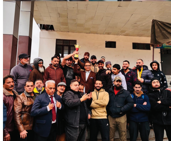
TWO- DAY STRENGTH LIFTING CHAMPIONSHIP CONCLUDES SUCCESSFULLY IN SRINAGAR