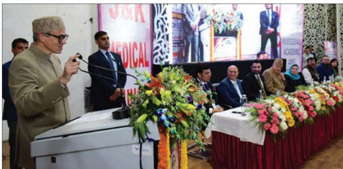
improve the emergency handling capability and capacity in

new GMCs so that the pressure on GMC Jammu and GMC Sri-