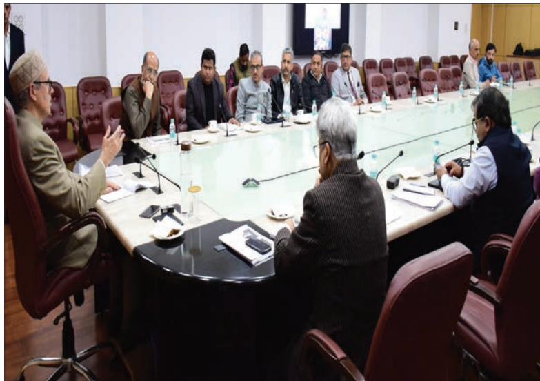
the budget will be approved on March 25, with the passage of Appropriation Bills. The Legislative Assembly will

As per the calendar, there will be general discussions on the budget on March 8, 10, and 11. The Finance Minister, who is also the Chief Minister, will conclude the general discussion on the budget on March 11 with his reply. According to the timetable worked out by the LA secretariat, demands for grants will be discussed on March 12, 13, 15, 17, 18, 19, 20, 22, and 24. After the demands for grants,