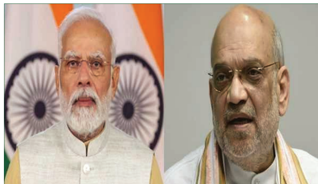
dedication to the nation. In his message, Shah said, "On behalf of the grateful nation, I pay my heartfelt tribute to the

In his message on the social media platform 'X' on Friday, Modi wrote, "Tributes to the brave heroes who lost their lives in Pulwama in the year 2019. Generations to come will never forget their sacrifice and