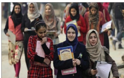
government had said that the degree colleges in the Kashmir Division and those in the winter