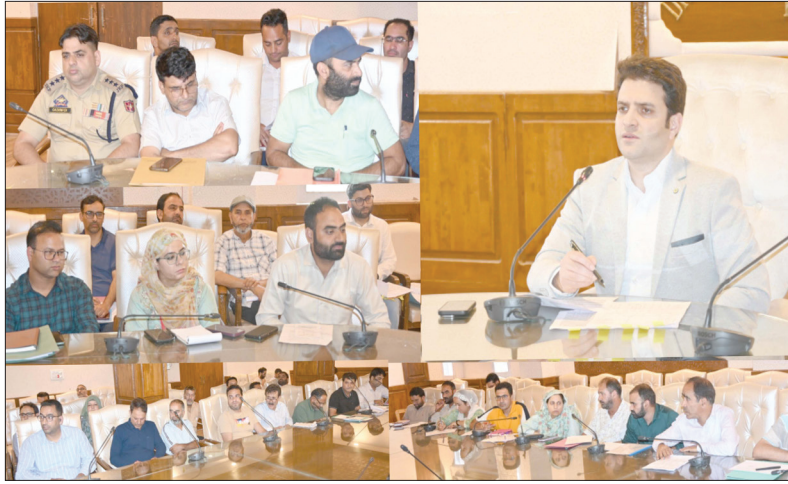
es and 17 samples were also lifted and sent for analysis to ascertain the

The Assistant Drug Controller reported that they have conducted 58 inspections suspended 06 Licenses and 17 samples were also lifted and sent for analysis to ascertain the quality parameters in the current month.