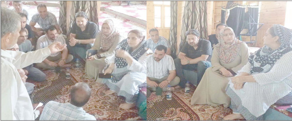
Muharram arrangements. She directed the R&B department to immediately start mac-

Special attention was given to crowd management, ensuring the smooth flow of processions. The deputations demanded uninterrupted electricity and drinking water supply, availability of mobile gensets, availability of mobile water tanks, sanitation and garbage lifting arrangements, decongestion of traffic outside Imambara particularly during peak periods, cleaning of surroundings, etc. On the occasion, the DDC directed all concerned to be proactive in ensuring better Muharram arrangements.