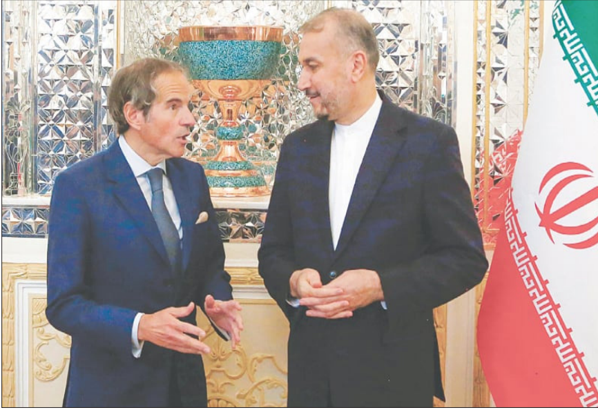
practical measures" with the "aim of restoring process of confidence building and increasing transparency". At its opening ceremony, Eslami

Grossi later said in a post on X, formerly Twitter, that at his meeting with the foreign minister he proposed "concrete