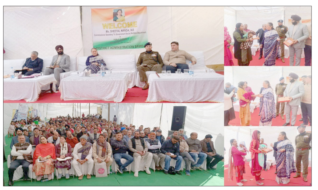
Besides, issues like road con-

The issues inter alia included repair of building in Rakh-Ambtali Panchayat, illegal mining, adequate water supply, timely release of land compensation in Chak Jhangi and shortage of linemen and sweepers besides immediate provisioning of tents during rainy season, improved road connectivity in Sumb Block particularly in Goran and Karad areas, installation of transformers in Ghagwal, desilting of canals and upgradation of healthcare facilities in PHC Sumb, Sangwali Mandi, development of Goran as tourist spot and measures to control the burgeoning stray animal popu-