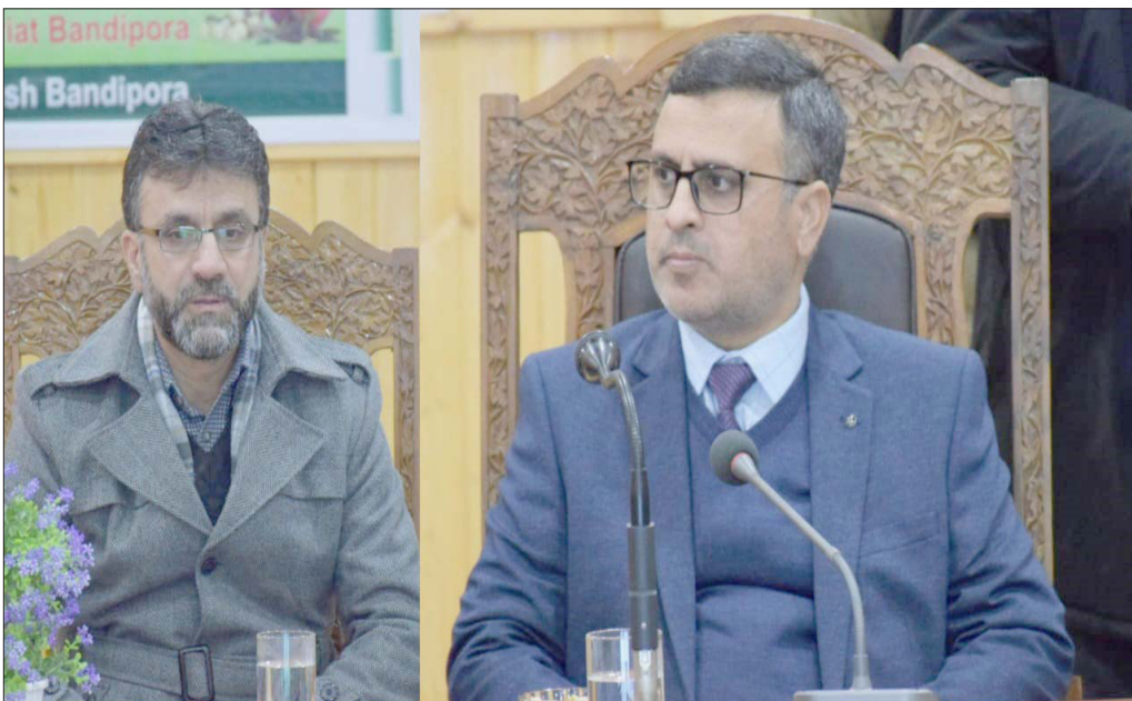
land issues for cultivation of medicinal plants, availability of land in schools for establishing

The DC was apprised that in Bandipora 21 dispensaries are functional with 21 Medical officers, besides various issues faced by department were also put forth before the chair including establishment of Herbal Gardens, fencing for Herbal Garden,