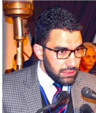
Assuring a positive and visible

"Such public engagements are an indication of hope of aspirations and expectations that people hold for the government," he said, adding that the Union Territory government is committed to addressing these concerns.