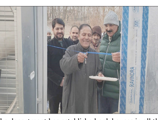
the department has established polyhouses in all the districts of Kashmir division.

Director Agriculture said that the good results coming out of these hi-tech poly houses help us attract young educated farmers towards this technology. He said that