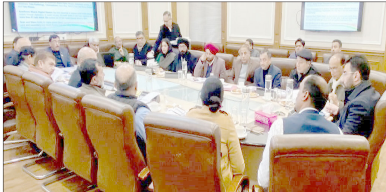
Hospitals and State Cancer Institutes in Jammu and Srinagar.