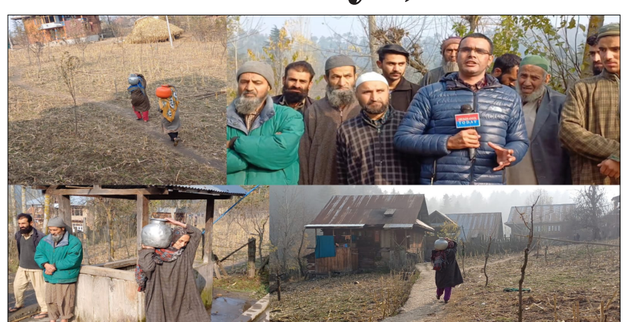
said,water supply to their village has been snapped due to some technical snag for the past Two months and they are being forced

Handwara, Nov, 23: The residents of Yamlar-Bala(Rajwar)area in north Kashmir's Kupwara district have expressed resentment against the authorities for failing to provide potable water to them, making people suffer. The residents said that few years back a water scheme under (JJM) was approved for the village but work on it has not been completed yet. A month and a half ago pipes were dumped in our village but ground situation is same like 1993. The residents said that the entire village which consists of more than 50 households get drinking water from a well located in the premises of a Jamia Masjid Shareef. Talking to HEADLINES TODAY(HT).the residents