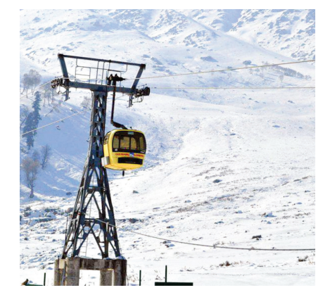
Managed and operated by I&K Cable TURN ON.....PAGE 02

SRINAGAR, NOV 23: More than nine lakh tourists have enjoyed the Gondola ride at Gulmarg this year and the figure is expected to cross more than million mark by the end of this year. Tourists describe the experience as surreal and alluring.