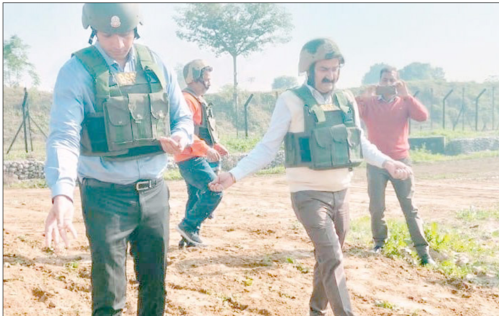
kathua has set a target of Wheat Sowing in 300 Acres of land during Rabi 2023-24