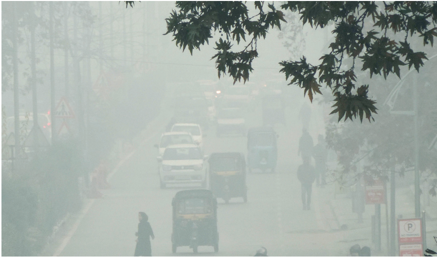
lights amid dim visibility due to thick fog. The tourists on Boulevard Road on the

The commuters had to move their vehicles on many roads in Srinagar, including the Boulevard Road, while keeping on the head-