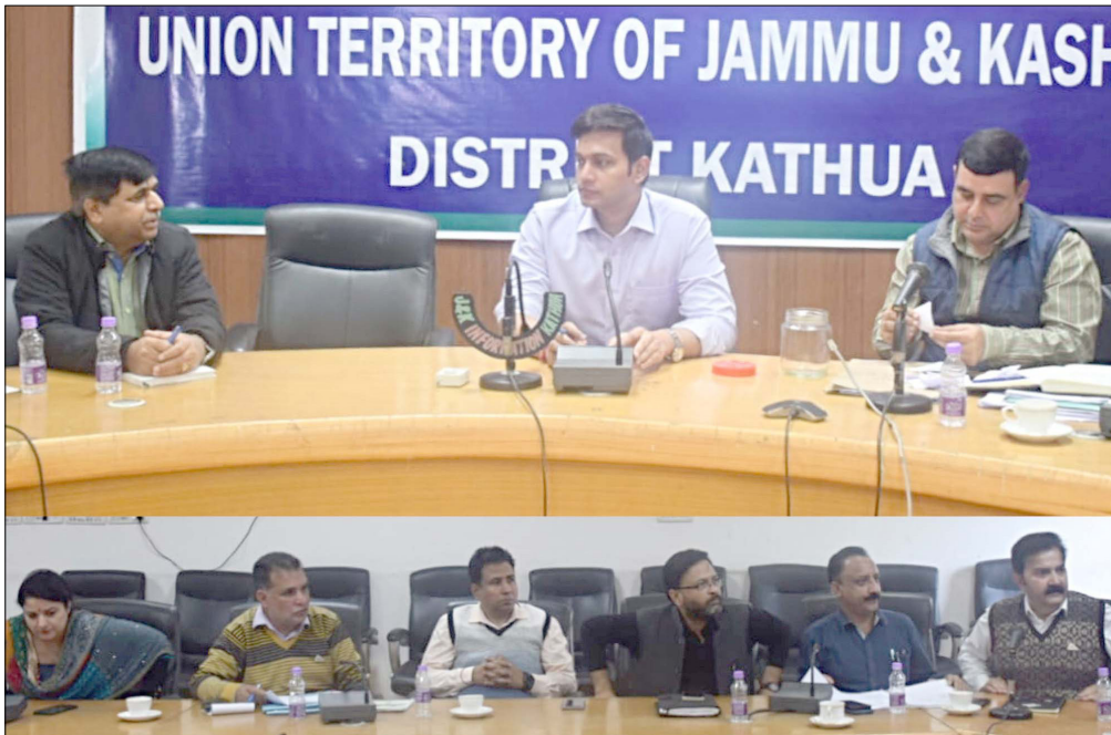
under other agriculture projects of the Agriculture Sector received on Kisan Sathi Portal.

After thorough scrutiny of the applications, the committee approved 629 applications under Integrated Farming System (IFS) and 118 applications