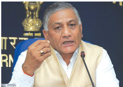
On the success of the G20, the

"Wait for some time, the PoJK will automatically merge with India," Singh in Dausa, Rajasthan responded after he was asked about the demands of PoJK Shia Muslims to open the roads to India.