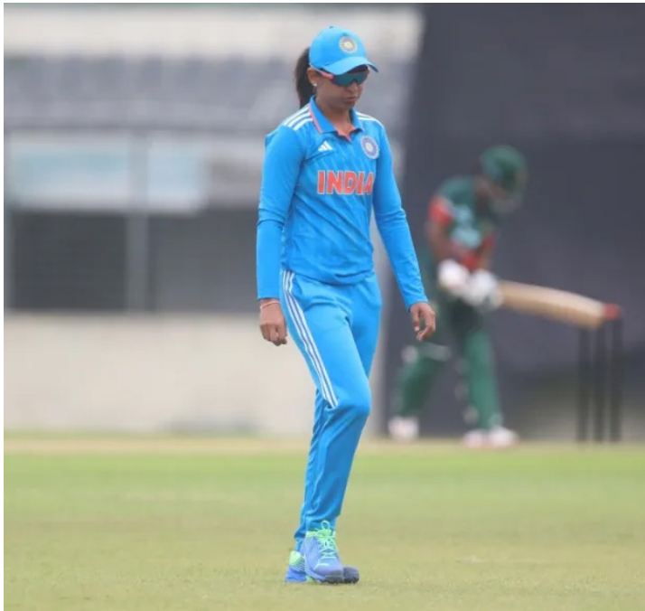
to make sure we have to deal with this this kind of umpiring and

"A lot of learning from this game. Even apart from the cricket, the type of umpiring that was happening there, we were very surprised," Harmanpreet said. "The next time whenever we are coming to Bangladesh, we'll have