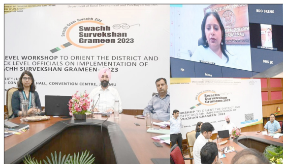
exhibit the success achieved in SBM-G. The Commissioner Secretary stressed upon the participants for effective cleanliness of villages, promoting awareness, encouraging behavioural changes, accessibility of assets, and fostering the adoption of

After inaugurating the workshop, the Commissioner Secretary in her address congratulated the officers for achieving 100% target of ODF Plus. She laid emphasis on upholding the same spirit in achieving the ODF Plus Model status and stressed to showcase the same spirit in the SSG-2023, where J&K will be competing with other states to