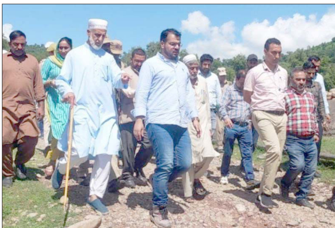
various problems faced by the local people. The Deputy Com-

The Sarpanch of the concerned Panchayat also apprised the Deputy Commissioner of