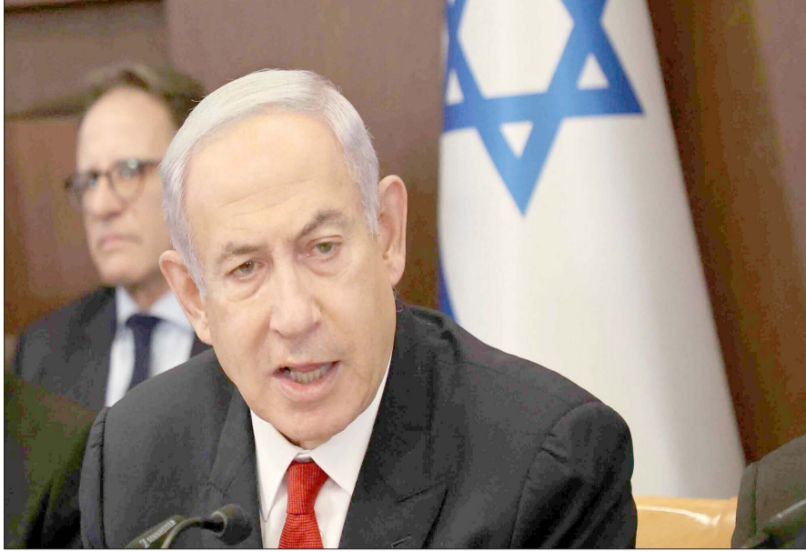
Isaac Herzog, whose post is largely ceremonial.

"An agreement is attainable. And yet, still no one is willing to sit down and talk, now, without preconditions. This is a blunder of historic proportions," said President