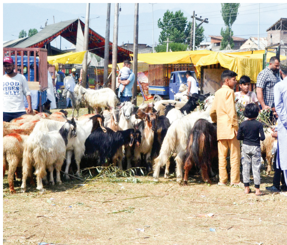
People gathered to buy sacrificial animals at a livestock market ahead of Muslim festival Eid-al-Adha (Feast of Sacrifice) in Srinagar on Monday