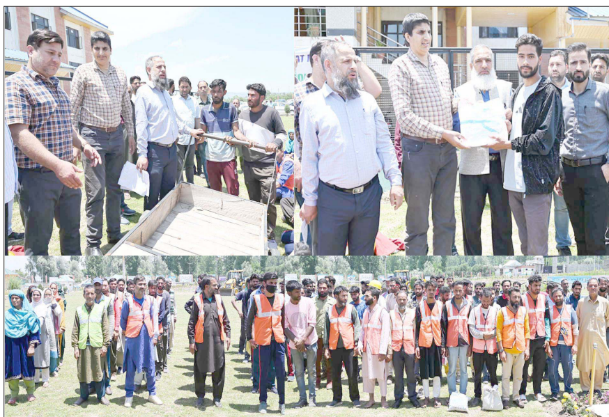
In the event, participation of elected representatives was highly appreciated and the general public was appealed to provide full support to the efforts of the administration for the purpose of Swatch Villages.

He also appealed to the general public to keep their environment safe and pollution free and support these sanitation workers to maximize their potential in ensuring cleanliness at grassroots level.