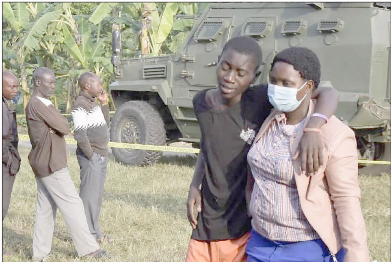
Lhubirira Secondary School in Mpondwe.

The Ugandan military and their Congolese counterparts launched joint operations on the rebel group in November 2021. Police said eight other people were in hospital with critical injuries after the attack at the