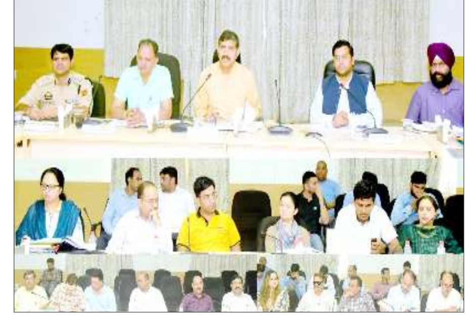
in the district. The District Development Commissioner apprised the chair that a number of works taken up in the district

ed by different departments and agencies