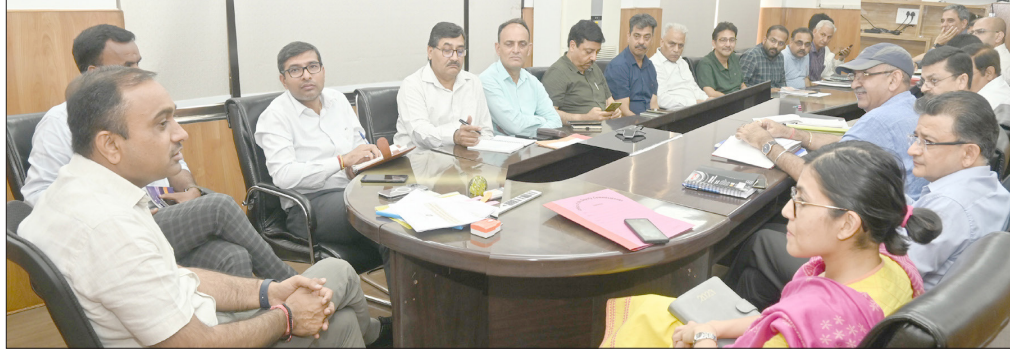
The cleaning of roads, flyovers and clearing of side drains also received attention during the meeting.

Recognising the significance of certain landmarks in Jammu city, the Div Com instructed the concerned authorities to focus on the beautification of the road leading to Jammu University and Bagh-e-Bahu temple.