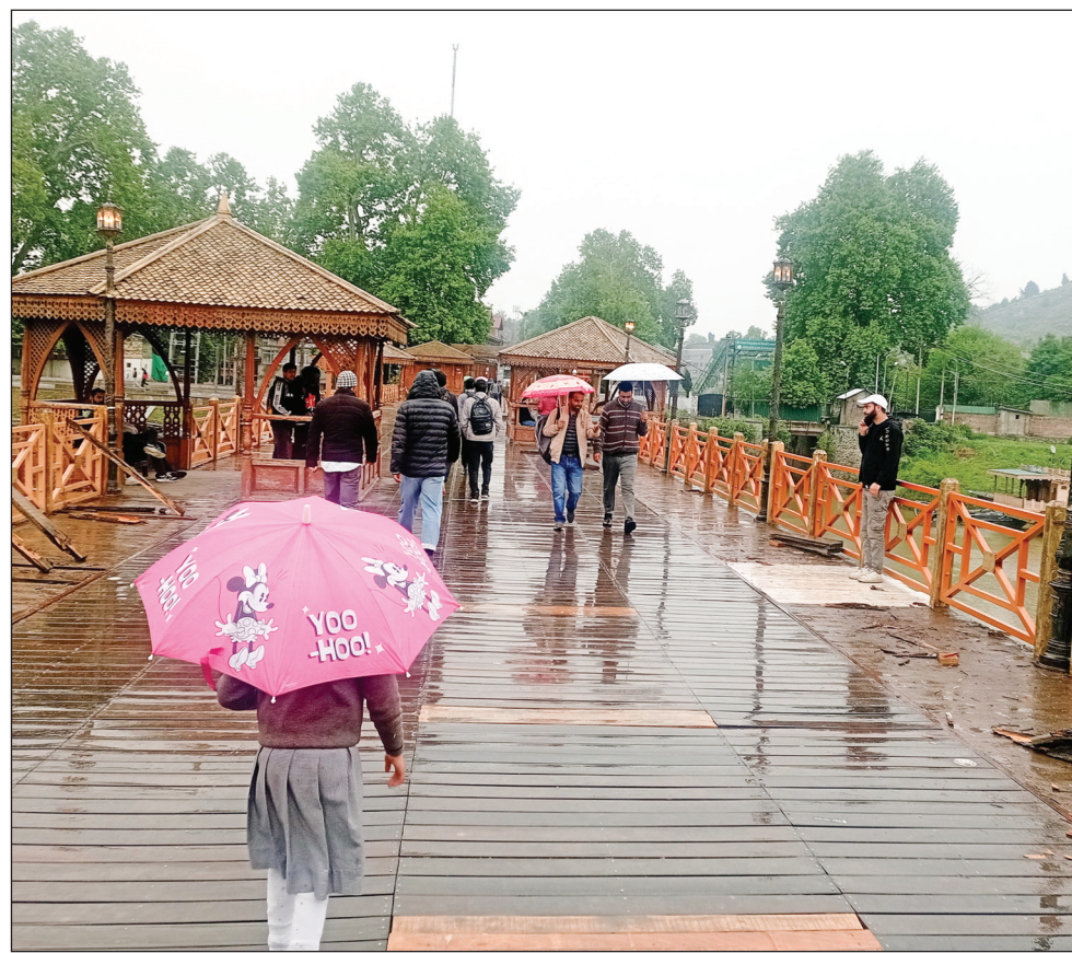
People using umbrellas to protect themselves from rain, in Srinagar on Saturday