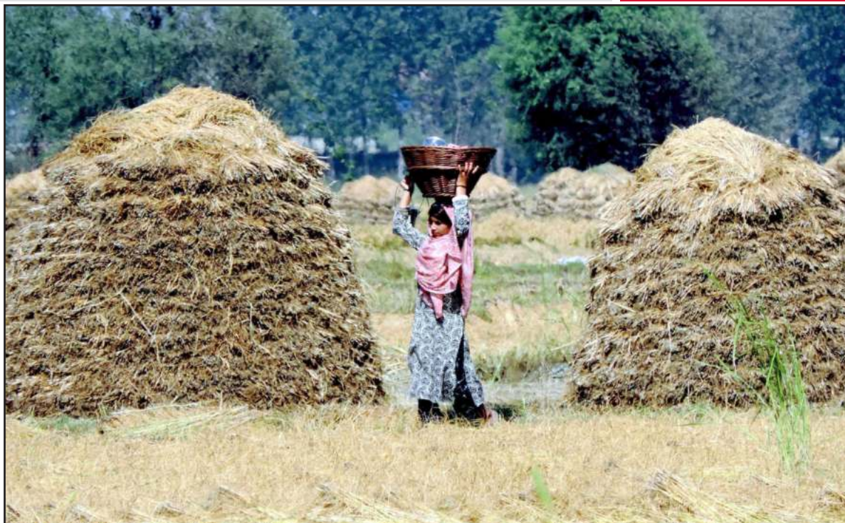
Women carry food for relatives working in the rice field during the harvesting of paddy crop on the outskirts of Srinagar on Friday.