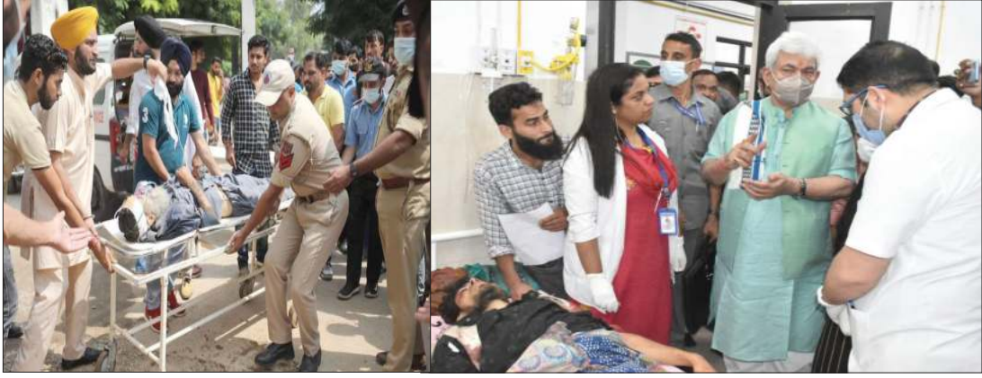
M S NAZKI HT CORRESPONDENT

Poonch, Sept 14 : Eleven people including mother-son duo were killed while 28 others were injured when a minibus they were travelling in skidded off the road and fell into a gorge in Poonch on Wednesday. Official sources told HT that the accident occurred near Barari Ballah Sawjian when the driver of a minibus bus (JK12-1419) apparently lost control over