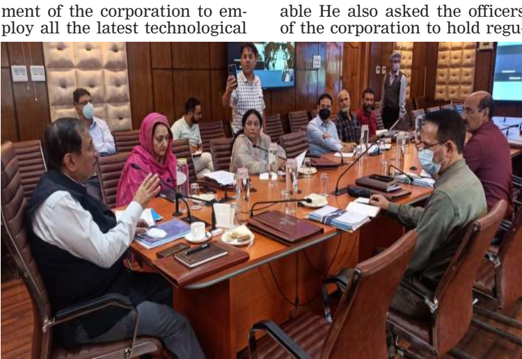
He also asked the officers of the corporation to hold regular awareness camps as well as interactions with the farming community at the Panchayat level with the involvement of PRI representatives so that maximum people are benefitted.