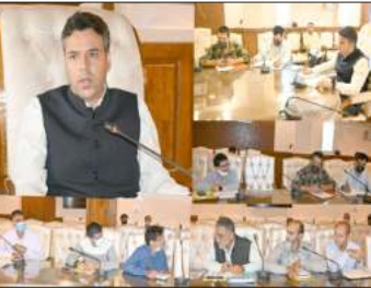
Societies/Cooperatives in the district. Under Yuva Sahakar, three societies shall be recommended and DPR for these societies are under process, he added.

At the outset, the DC took detailed review of the updated Audit position of cooperative societies, financial status of the units, besides discussing issues faced by societies. The Deputy Registrar Cooperative apprised the chair that there are a total of 87 functional Cooperative