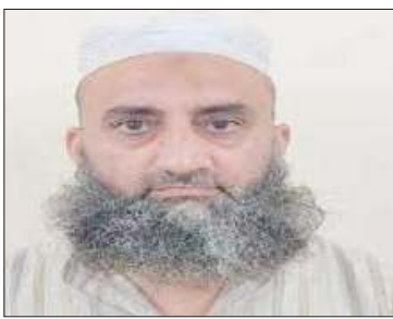
HT NEWS NETWORK

New Delhi, August 19: A 48-year-old Delhi based garment trader allegedly working as an agent in routing hawala money to militant outfits Lashkar-e-Taiba (LeT) and Al Badr has been arrested from Delhi, police said on Friday.