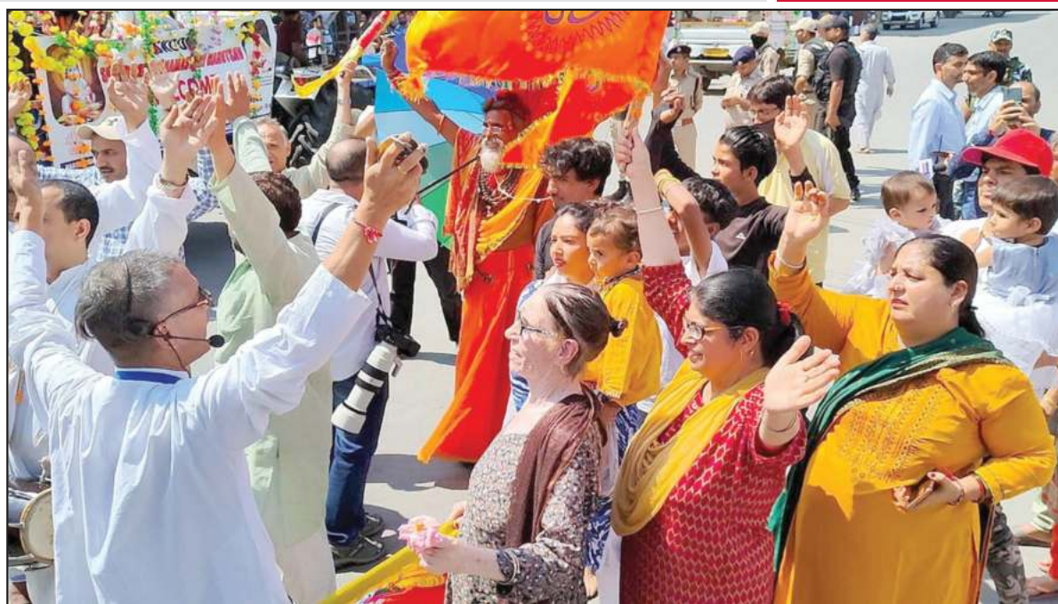
Kashmiri pandits taking out a Janmashtami procession at Lal Chowk, in Srinagar on Friday.