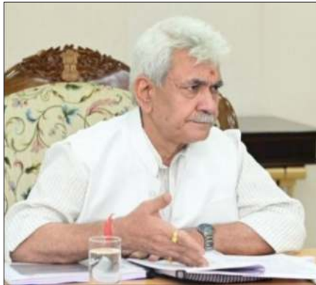
HT NEWS NETWORK

Srinagar, August 19: Lieutenant Governor of Jammu and Kashmir Manoj Sinha Friday claimed that Kashmiri separatist leader Mirwaiz Umar Farooq has not been placed under house arrest.