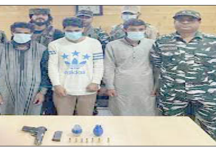
Two charged in fraud sim card case in Kupwara

Srinagar, August 04: Police on Thursday claimed to have arrested three militants along with arms and ammunition at Fruit Mandi crossing in North Kashmir's Handwara. A police spokesman in a statement, said joint parties of Police, Army 21 RR and 92 Bn CRPF were conducting naka checking at Handwara. During checking, the joint parties apprehended 03 persons, who attempted to flee from the CONTINUED ON » PAGE 10