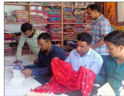
Kashmir art products. The Handicraft dealers and other stake holders are accordingly advised to play their role in promoting the GI tagging on the notified Kashmir Crafts.

The dealers were also apprised about the benefits of the GI tagging on the notified Kashmir Crafts, and impact of such tagging in building the brand image of Kashmir Arts products. The certification and authenticity will also help in eradicating the menace of machine made and misbranding of