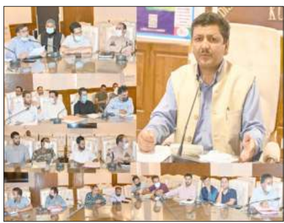
across the district. PDD and Jal Shakti departments were directed to ensure proper management of electricity and water including water tankers at the venue.

KULGAM, AUGUST 04: The Additional District Development Commissioner (ADDC) Kulgam, Riyaz Ahmad Sofi today convened a meeting of Officers to review arrangements being put in place by different departments for celebration of Independence Day, 2022. During the meeting DPL Kulgam was selected as the main venue for the celebration where the Chief Guest will unfurl the national flag at District Level. Threadbare discussion was also held with regard to the security arrangements, traffic regulation, seating arrangements, Full Dress Rehearsal, decoration, Shahnaivadan, PAS, power and water supply, transport arrangements, sanitation, Medicare facilities, invitation cards, Barricading at venue of the function, etc. The ADC directed all officers to make fool-proof arrangements at all levels in advance for the National event to make it a great success. He instructed the Officers to ensure all related arrangements are made well in advance and work in close coordination for the smooth conduct of Independence Day celebrations